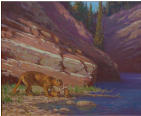
"Cougar, Rose's Canyon, Flathead Valley, British Columbia" (2010), by Dwayne Harty. Oil on canvas 20 x 24 inches.

© Dwayne Harty and Yellowstone to Yukon Conservation Initiative