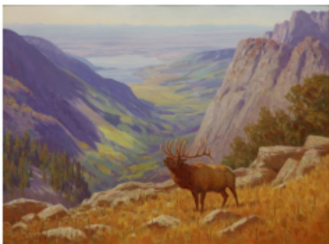
"Elk / Newforks Lake, Wyoming" (2010), by Dwayne Harty. Oil on canvas 30 x 40 inches.

The result: a world class exhibit titled, "Yellowstone to Yukon: The Journey of Wildlife and Art", on display now at the National Museum of Wildlife Art in Jackson, Wyoming, until August 14.